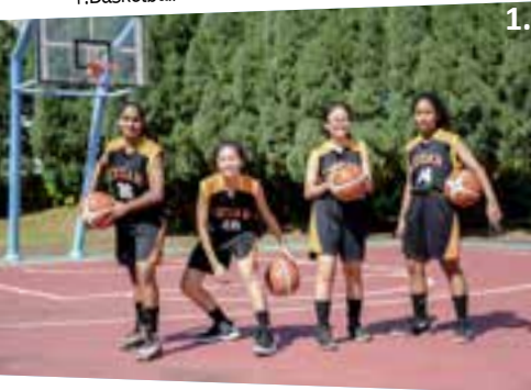
1. Basketball 2. Netball 3. Badminton 4. Track & Field 5. Football 6. Volleyball 7. Table Tennis