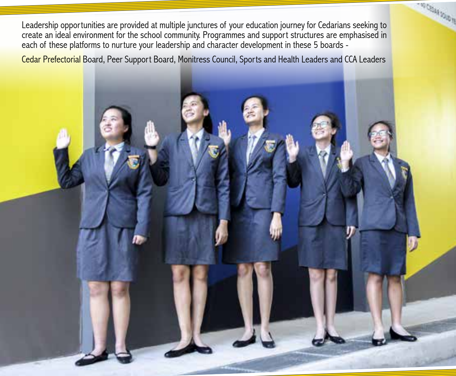
Leaders of Character

Cedar Prefectorial Board, Peer Support Board, Monitress Council, Sports and Health Leaders and CCA Leaders